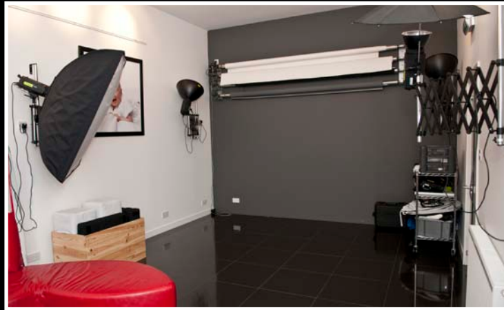
Studio with a range of backdrops