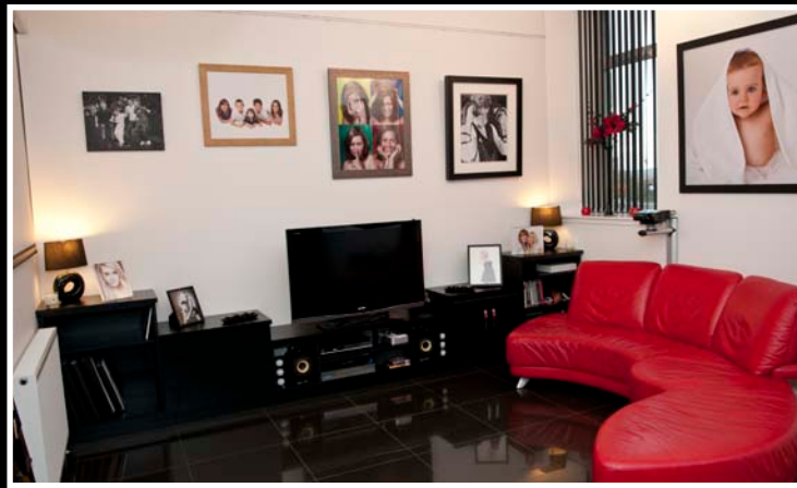
Projection viewing system